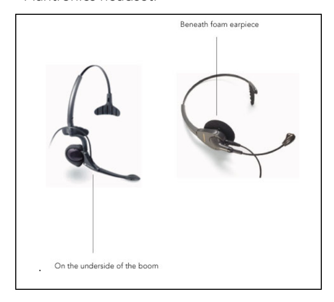
Fig 2. Locating the product number on a Plantronics headset.

The identification number of a Plantronics headset is printed on the microphone boom or beneath the foam cover on the headset earpiece. The first letter in the number identifies the product line—H for H Series and P for Polaris.