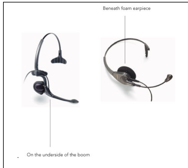
Fig 2. Locating the product number on a Plantronics headset.

The identification number of a Plantronics headset is printed on the microphone boom or beneath the foam earpiece. The first letter in the number identifies the product line—H for H Series and P for Polaris.